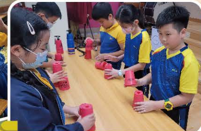
Students enjoy cup stacking SO MUCH!