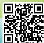
Crossword Puzzle (Answer)